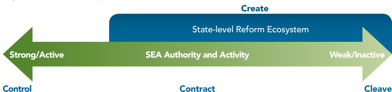
Figure 3. SEA Authority and the 4Cs

Instead of doing "more, better," tomorrow's SEA should do "less, better." The SEA must empower the field rather than trying to unilaterally lead it. 68 Let's look at how this approach might work in practice.