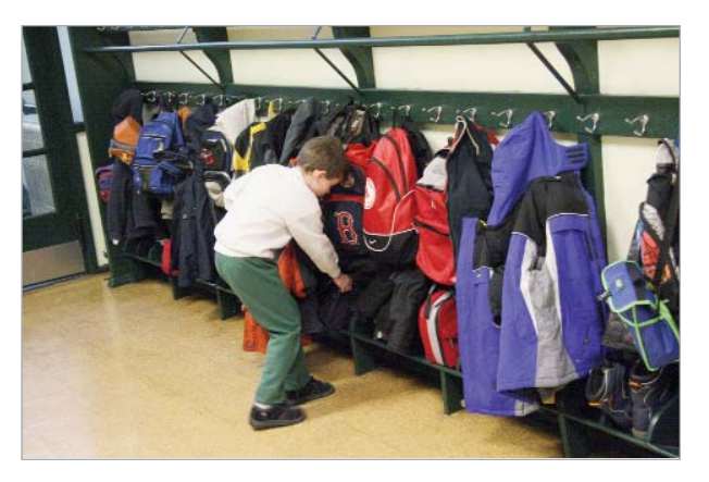
Two generations ago, when St. Columbkille's enrollment was at its peak, there were twice as many coat hooks and they were crammed full.

The coat hooks are one illustration of St. Columbkille's history. Nearly 300 of them line the first floor hallways. On this snowy day, few of them