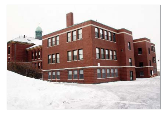
The partnership with Boston College allows St. Columbkille to preserve Catholic education in the Allston-Brighton section of Boston.

Boston College's vision for transforming St. Columbkille goes far beyond saving one school. It's making the school a pilot project for a new model of sustainability for urban Catholic schools. It's the