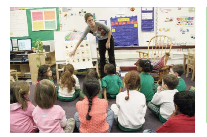
In recent decades a veritable United Nations of immigrants has moved in to the surrounding area. The school's current demographics reflect these changes.

The school's current demographics reflect them, too. Forty percent of the students are white; 20 percent are Hispanic and Haitian, respectively; 12 percent are Asian; 5 percent are multi-racial and 3 percent are black. Nearly eight in ten are Catholic and about seven in ten get financial assistance with the $3,000 tuition.